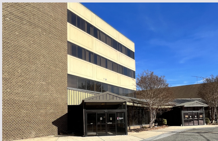
Pictured Above: 321 E. 11th Street in Wilmington, DE.

Revitalization on DAHG's new property at 321 East 11th Street in Wilmington Delaware has begun. Roofing for the building has been the main focus for renovations this quarter. Renovations are more than 30% completed.