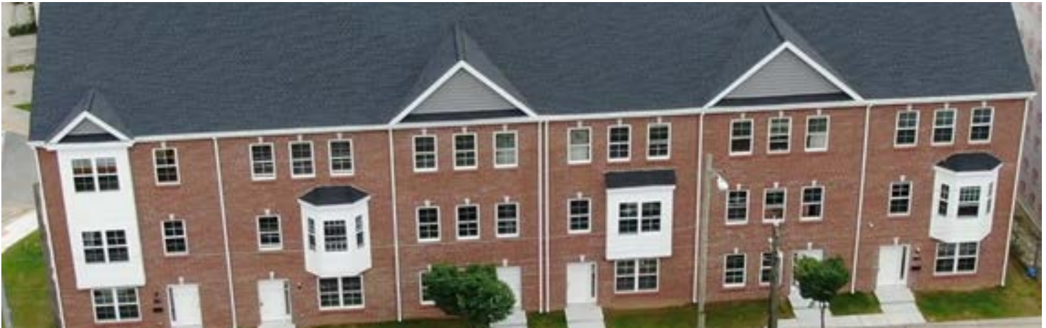
Pictured Above: Frontage of McMullen Square.