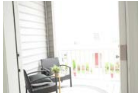
Pictured Above: McMullen Square Main Living Area, Kitchen, Bedroom, Den, and Deck