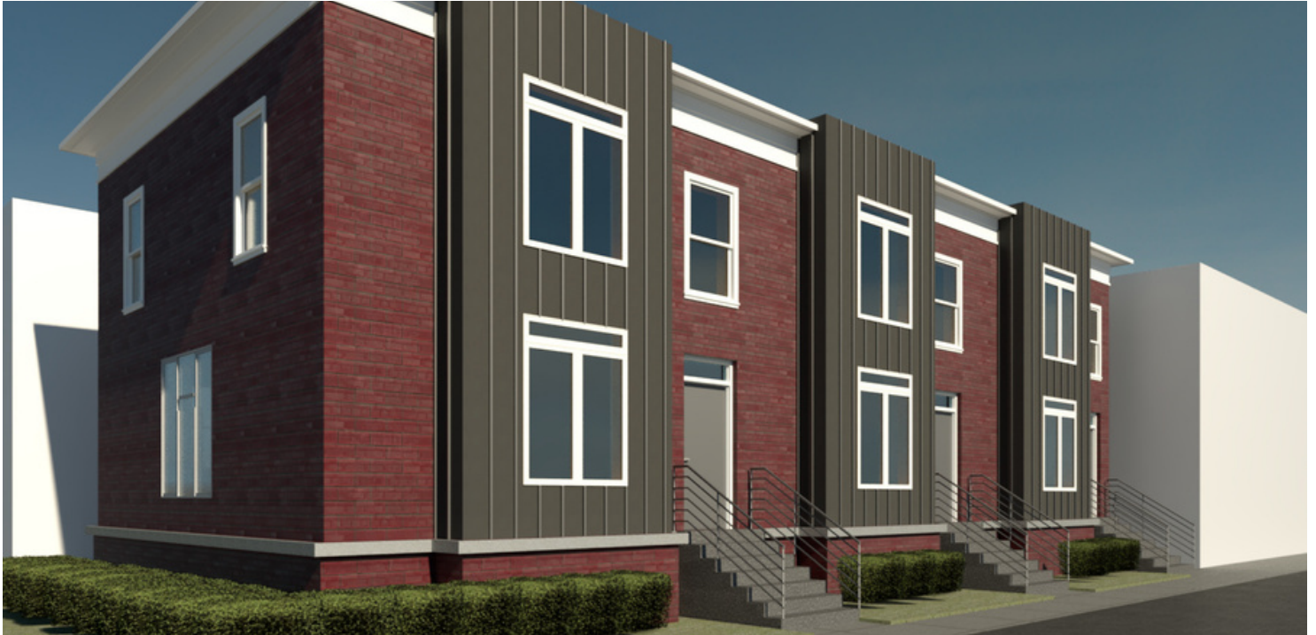
Pictured Above: Rendering for 801 to 809 Bennett Street in Wilmington.