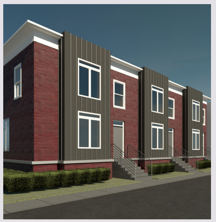
Pictured Above: Rendering for 801 to 809 Bennett Street in Wilmington.