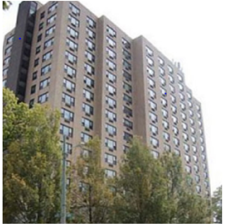
Pictured Above: Park View Apartments of Wilmington