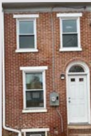
Pictured Above: 704 Bennett Street.