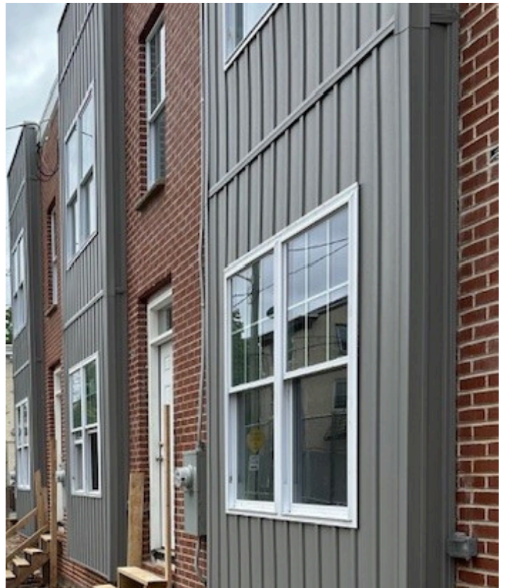
Pictured Above: Frontage at 801 to 809 Bennett Street in Wilmington.