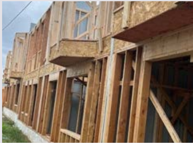
Pictured Above: Initial Phase of McMullen Square.