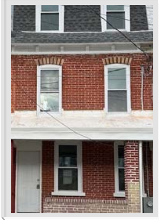
Pictured Above: 931 Vandever Ave., Wilmington property.

On Tuesday, April 16, 2024, the Delaware Affordable Housing Group (DAHG) collaborated with the Wilmington HOPE Commission to mark the opening of Wilmington HOPE Commission's Reentry Supportive Housing at 931 Vandever Avenue in Wilmington, DE. According to the Wilmington HOPE Commission, supportive housing plays a crucial role in supporting successful reentry and addressing issues that often lead justice-involved individuals to reoffend. Providing access to housing also enhances public safety, as studies have demonstrated a correlation between housing stability and reductions in crime and repeat offenses.