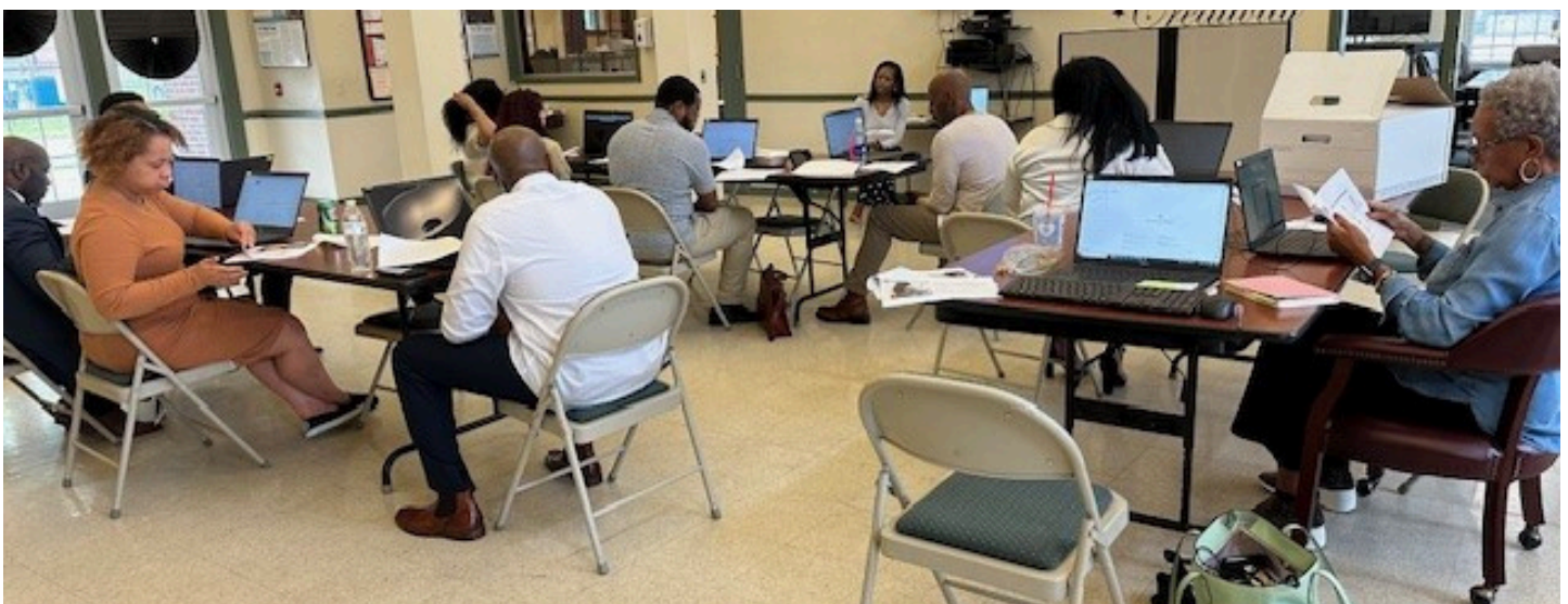
Pictured Above: WHA & DAHG team members participate in Chat GPT training.