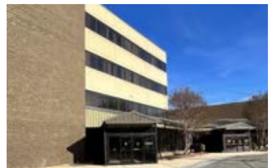
Pictured Above: 321 E. 11th Street in Wilmington, DE.

For more information, email info@dahg.org .