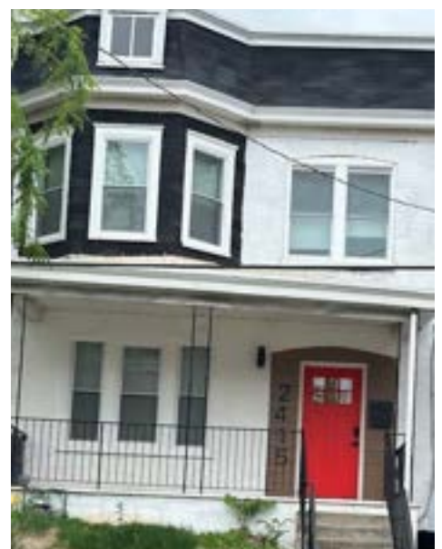
Pictured Above: 2415 Market St.