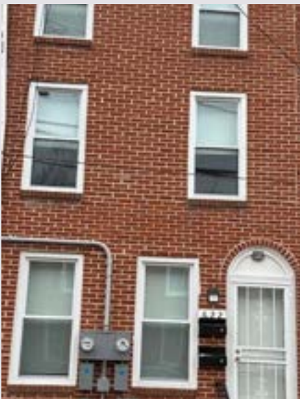
Pictured Above: 622 W. 5th Street.