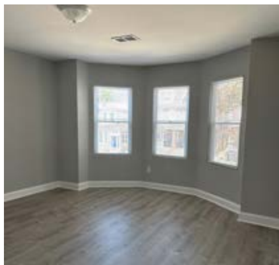
Pictured Above: Renovated WHA property.

For more information on becoming a DAHG resident email DAHGhousingapplications@whadelaware.org .