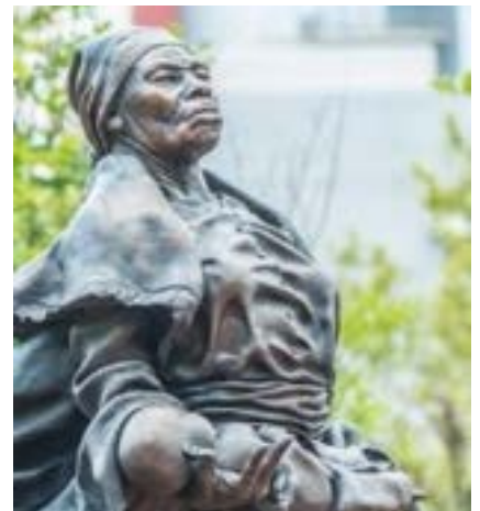
Pictured Above: Harriet Tubman Sculpture