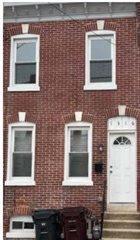
Pictured Above: 1316 W. 3rd St., Wilmington, DE