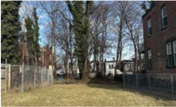
Pictured Above: Vacant lot of 213 and 215 W. 24th Street