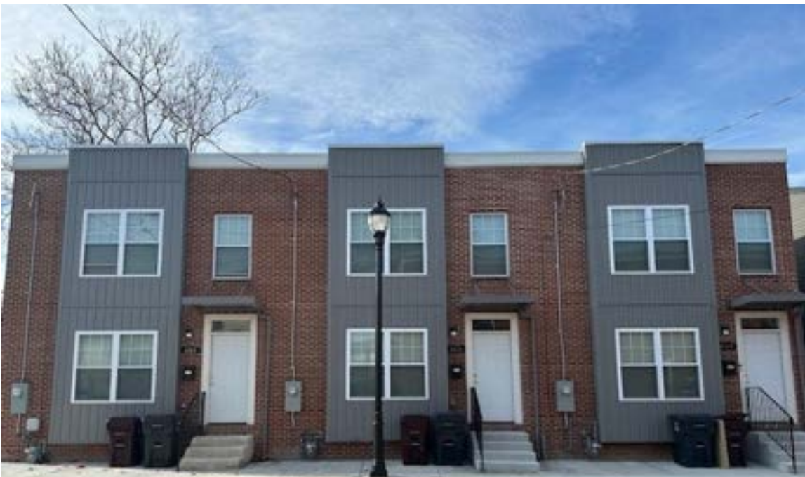
Pictured Above: Bennett Street completed units