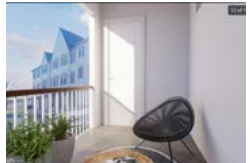
Pictured Above: McMullen Square Main Living Area, Kitchen, Bedroom, Den, and Deck