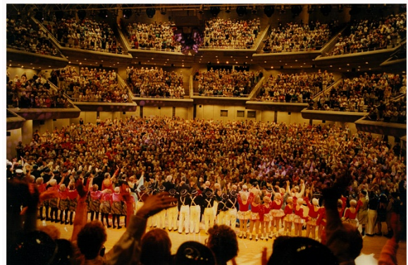
Jubilee curtain call at Roy Thompson Hall

We aim to unite through a shared sense of artistic purpose, diverse senior communities and different organisations all over the province and ultimately across the country, which calls on each one of us to respond and support this initiative by giving back through life-changing experiences.