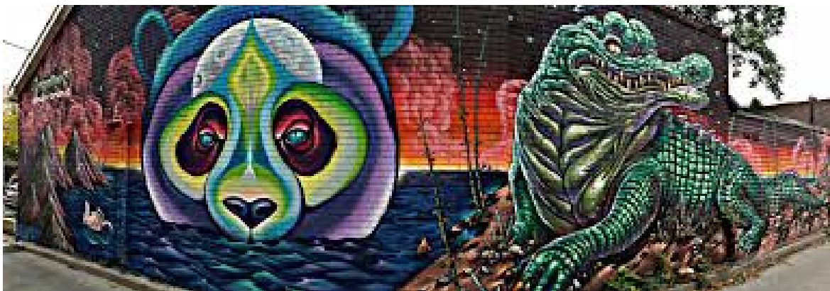
Toronto Street Art

The organisation will promote an ethos of empowerment and equality in relation to ageing, and will view older people as a societal resource with rights of participation, consultation and decision-making.