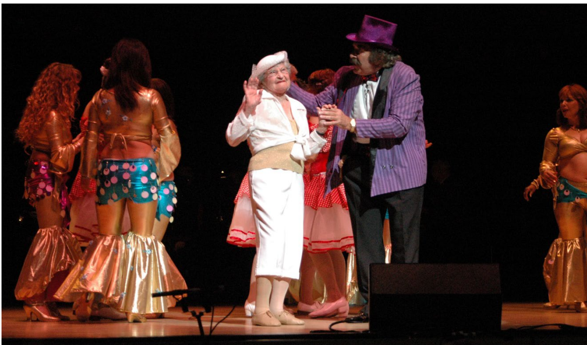
Jubilee Opening 2008