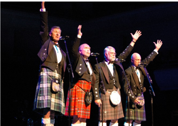
Claymore Scottish Dancers, Caledon, ON