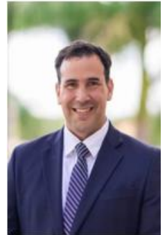
In Christ through Mary,

As we approach Christmas and finish this Advent season, pray for Catholic school leaders that they may attune their hearts to the quiet coming of Our Lord and direct the hearts of those in their care to the peaceful Nativity, where Joseph stands silently by Our Lady. Together, they adore Jesus in this world for the first time. May we approach the Nativity with the same wonder and awe of that "hour and moment at which the Son of God was born of a most pure Virgin at a stable, at midnight, in the piercing cold."