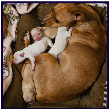
Mama Camy with her litter who all found forever homes thanks to PWB. Mama Camy is still waiting to find hers!

Founded in 2020, Pups Without Borders specializes in rescuing pregnant dogs, nursing litters, and orphaned puppies from dangerous situations in the US and Mexico. Small but mighty, this extraordinary rescue has already saved over 5,000 dogs . Their lifesaving work depends on the support of the community.