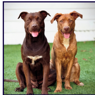
Ziggy & Bixby, PWB alum