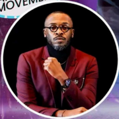
SINGER, AUTHOR & ADVOCATE LONDEL COOK