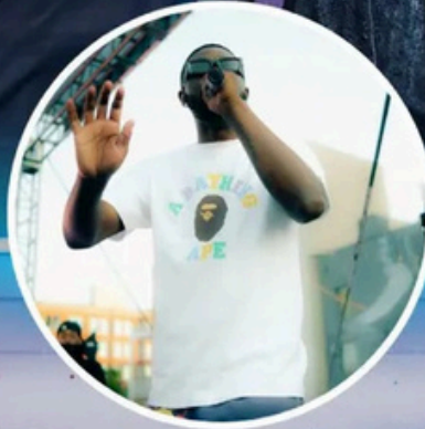
ARTIST/PRODUCER HBK BOOM