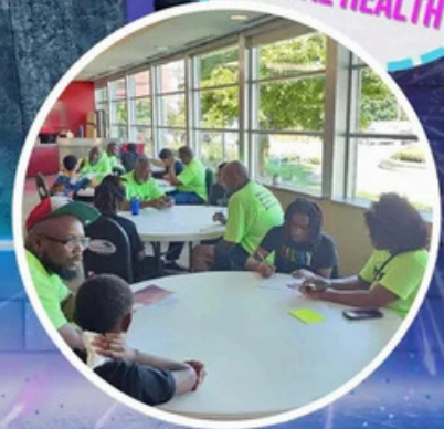
MENTORSHIP ORGANIZATION H.E.L.P. SAGINAW

THOMPSON MIDDLE SCHOOL 3021 COURT ST. SAGINAW, MI