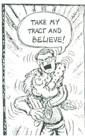
How not to do it!

Our Motivations: - Christ's love for Christ and our privilege - to serve Christ, to