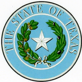
GREG ABBOTT, GOVERNOR OF TEXAS