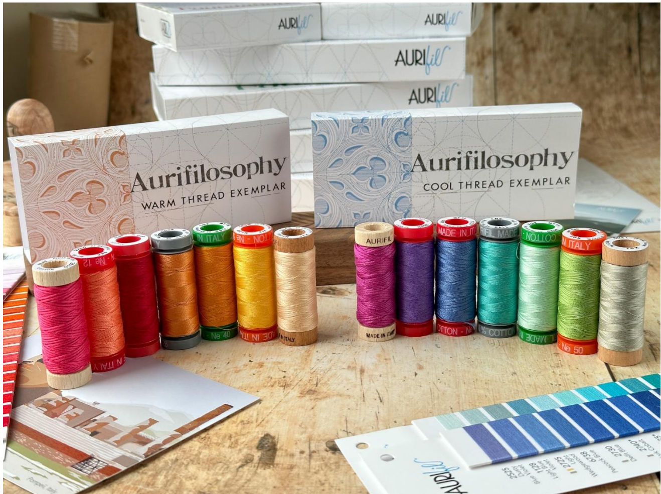
Thread Exemplar Cool (Mixed)