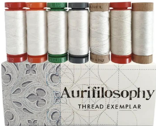
Thread Exemplar Natural White 2021