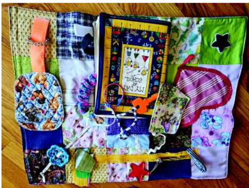
Examples of completed fidget quilts