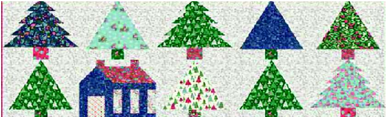
Christmas in the Woods by Riley Blake Designs