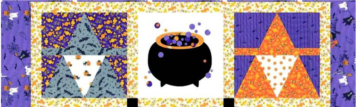
Witched Party by Denise Russell