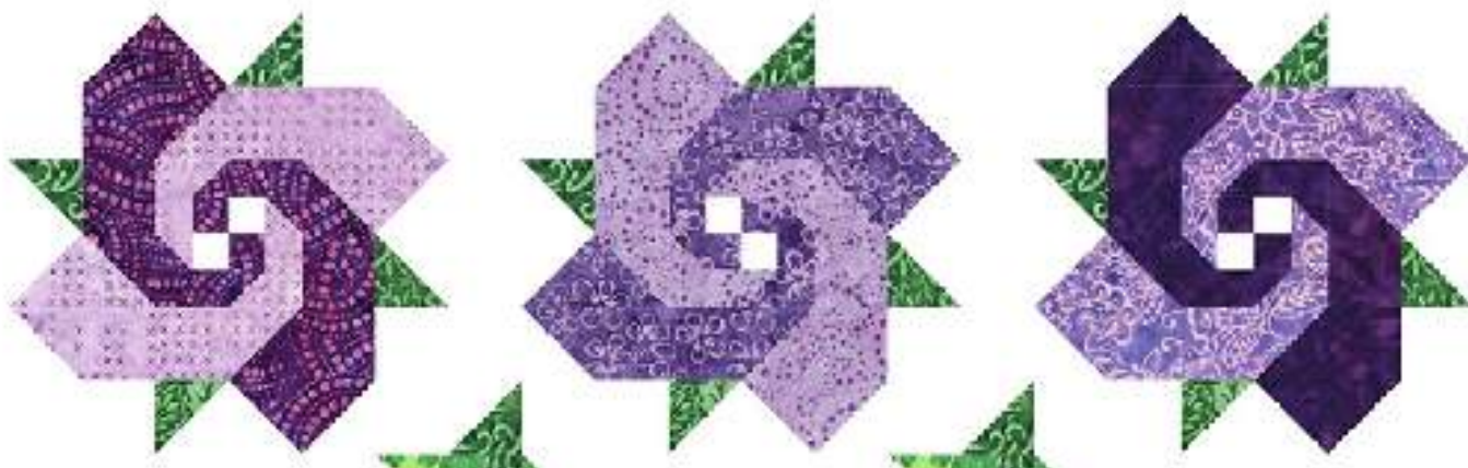
Sweet Trails bt Canuck Quilter Designs