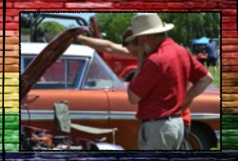
Green Team Electric Vehicle Information Session, June 2, 1 pm Air Museum