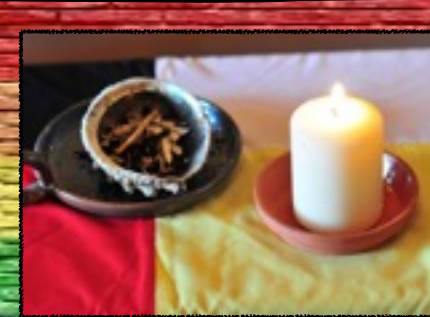
Sharing Circles on March 21 & April 30 at 6:30 pm