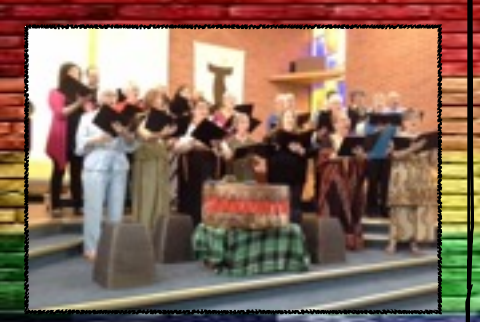
Spring Choir Concert -The Four Elements, April 22 at 7:30 pm

Bring the whole family and come celebrate Easter Sunday with us. Sunday morning during worship.