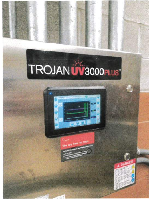
Figure 0-9 - New UV Disinfection System