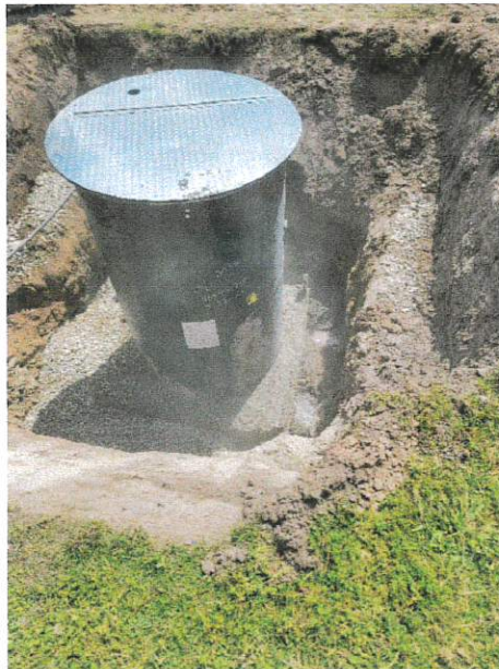
Figure 0-12 - New Grinder Pump – 1 of 36 installed