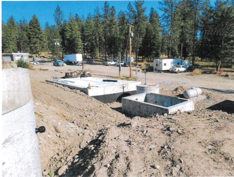
Figure 0-11 - Polishing Reactor on Left – Metering Vault (to measure flows from Reactor)