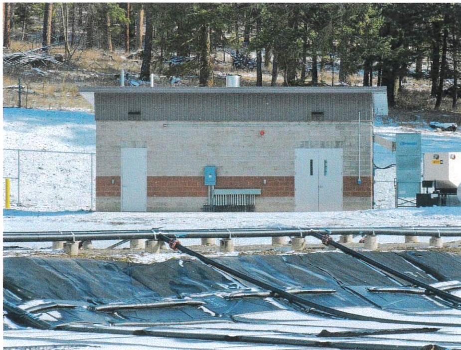
Figure 0-6 - New Headworks Building