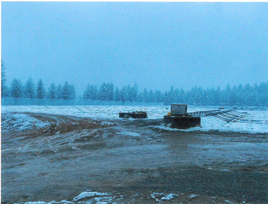
Figure 0-2 - New Liner & Aeration System