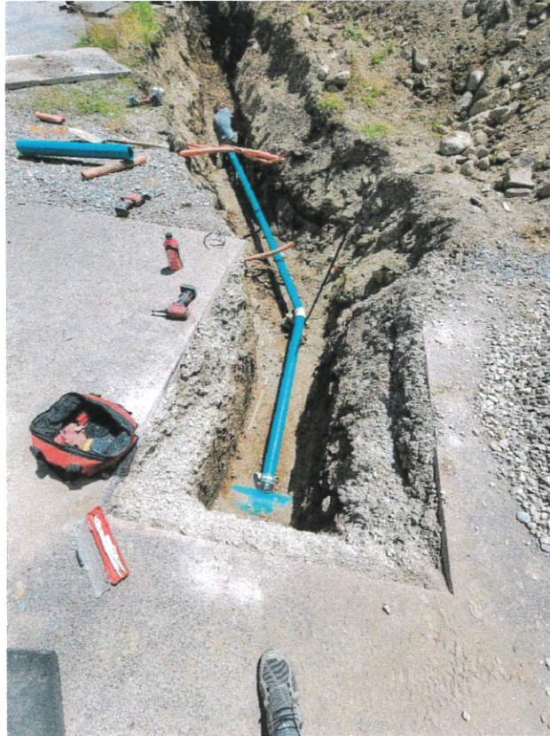
Figure 0-15 - New Sewer Main