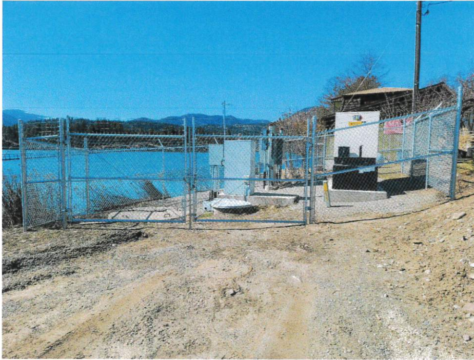
Figure 0-1 - Main Lift with New Generator & Electrical Upgrades

Attach any reports or deliverables that were completed during this period.