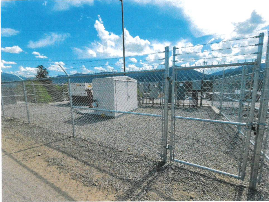
Figure 0-7 - New Lift Station #2