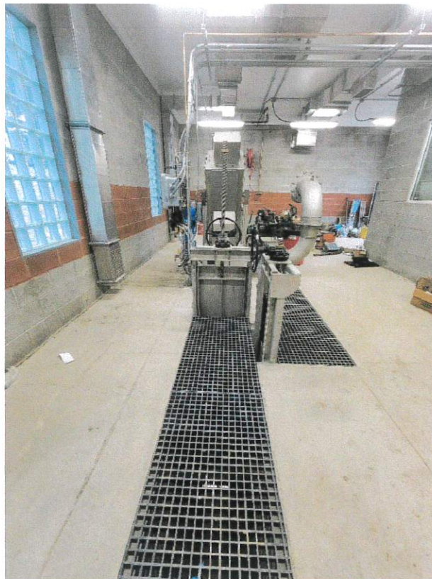
Figure 0-14 - Interior of New Headworks Building – First Step in Treatment Process