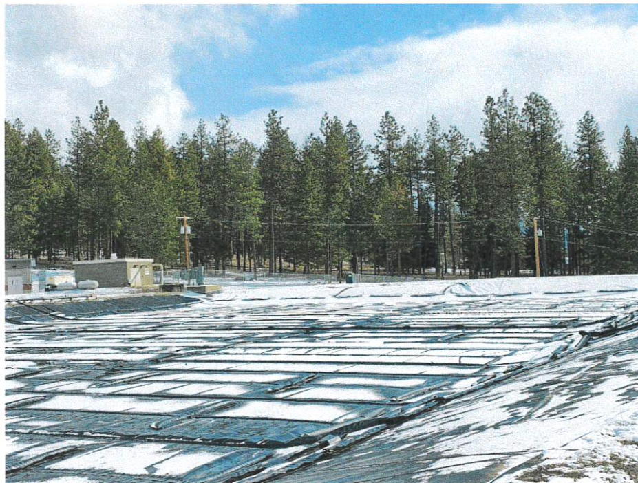
Figure 0-4 - Cell #2 Facing Rehabilitated Blower Building