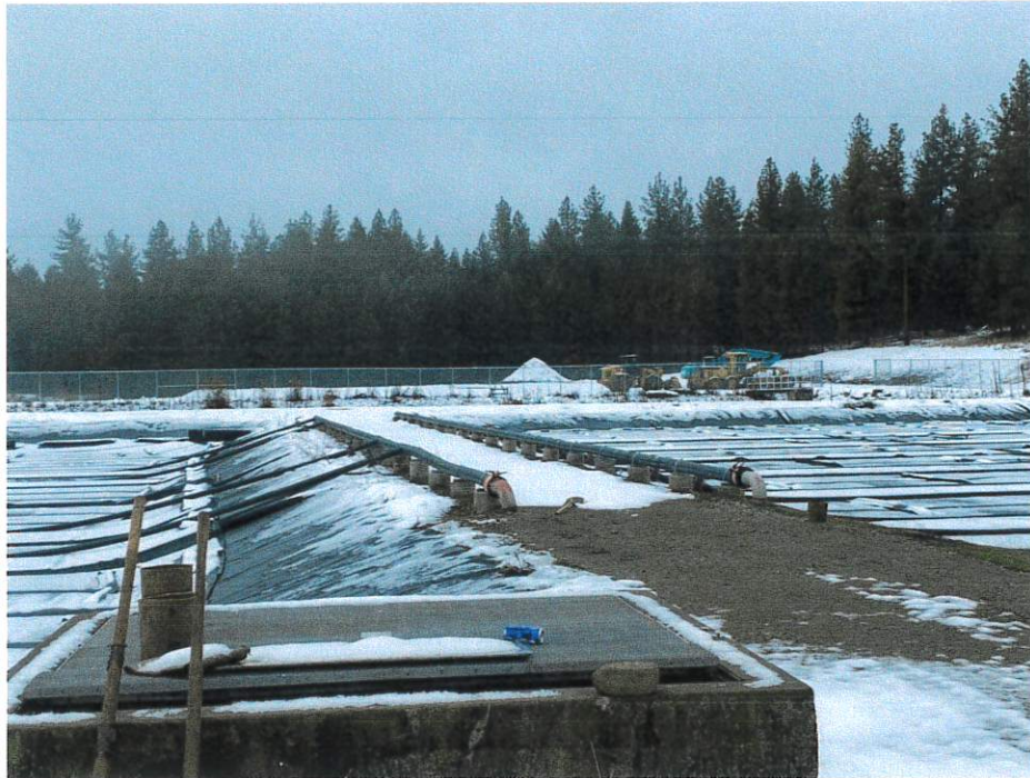
Figure 0-3 - New Aeration System Piping