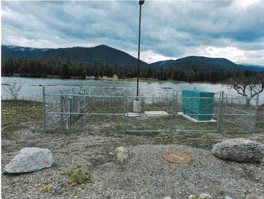
Figure 0-13 - New Ferry Street Lift Station with Clark Fork River in the background.