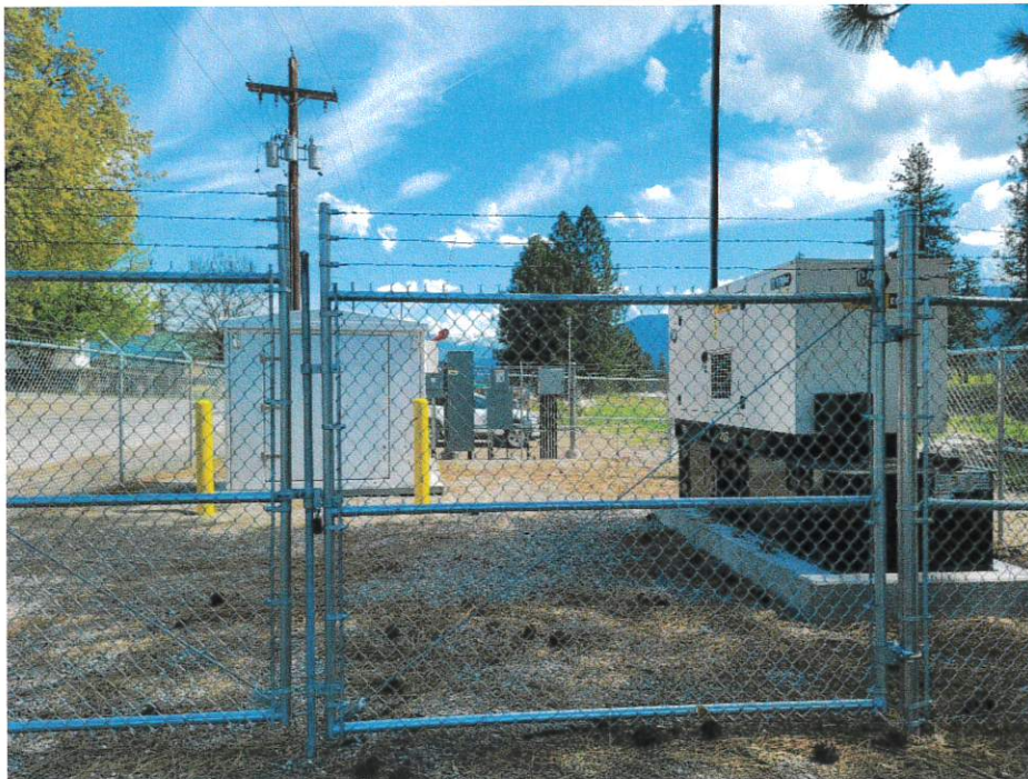
Figure 0-8 - New Lift Station #1