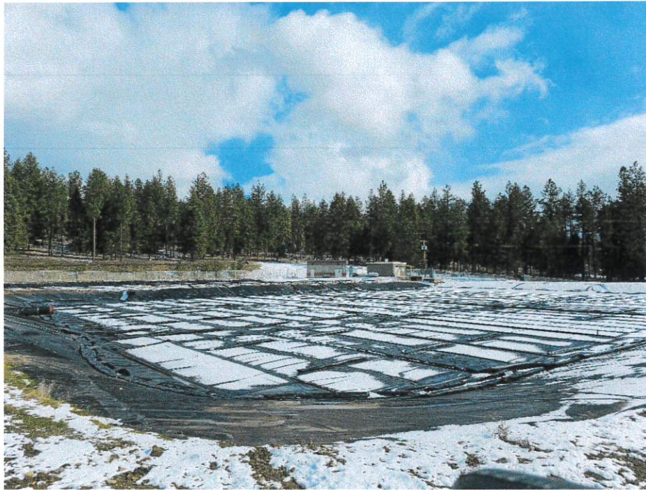
Figure 0-5 - Cell #2 with New Headworks Building on the Left