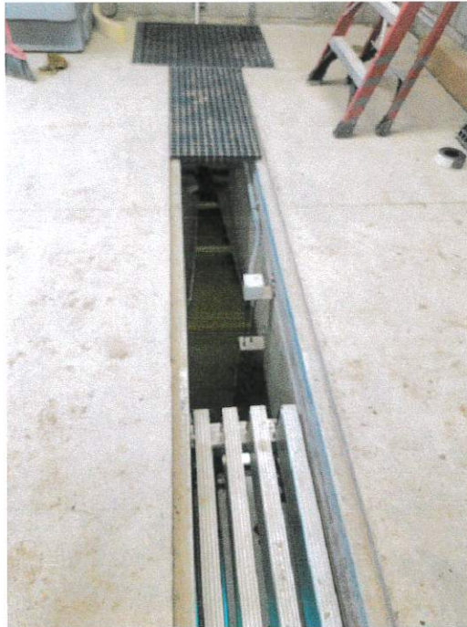
Figure 0-10 - UV Channel - Location of UV Bulbs (Source of Disinfection)