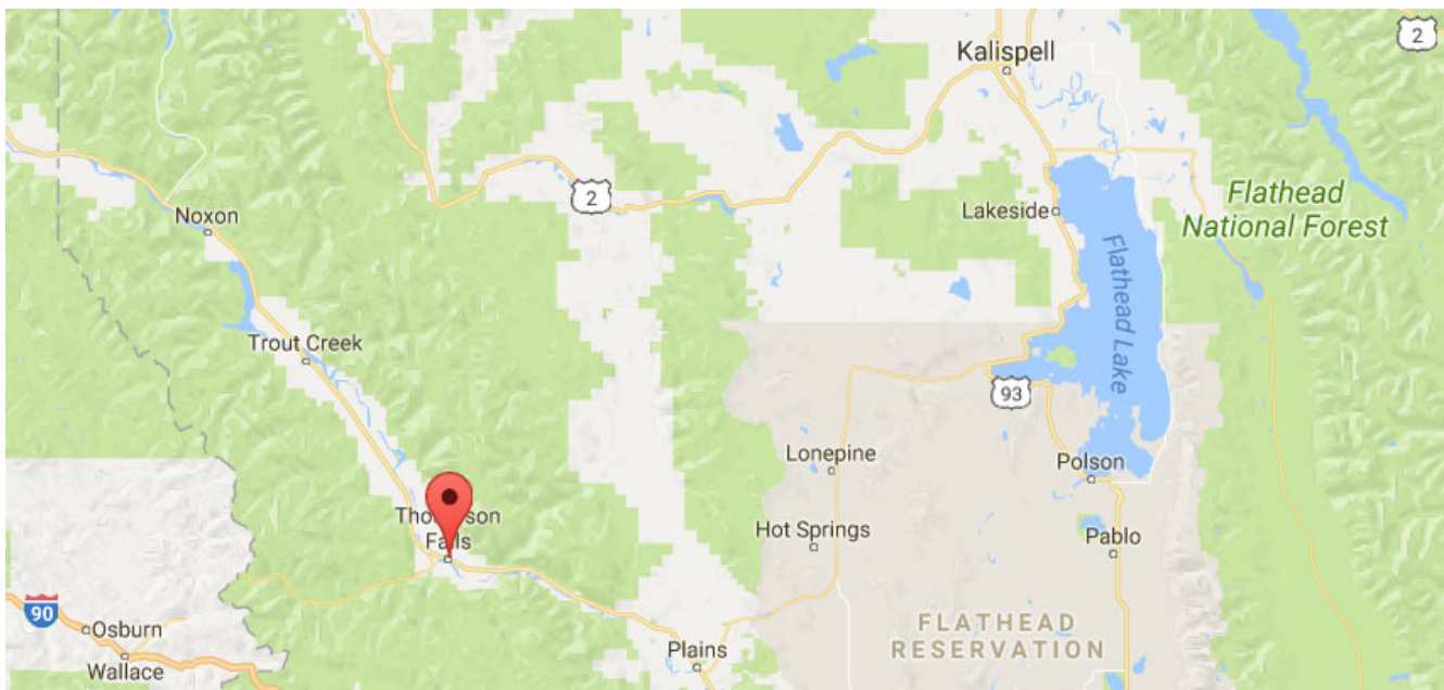
FIGURE 1. GENERAL VICINITY MAP

The City of Thompson Falls is proposing to build a park at the northwest intersection of Maiden Lane and Lincoln Street, just south of W. Main Street (Hwy 200). The project is located in Government Lot 6 of Section 7 and Government Lot 4 of Section 8, T21N, R29W, P.M., M, City of Thompson Falls, Sanders County, Montana (see vicinity map below). The proposed Ainsworth Community Park will serve as the keystone park in the City's urban system and will include a pavilion with restrooms along with an amphitheater. This park will be capable of holding events, concerts, and family gatherings. Its presence is expected to increase the number of events downtown, stimulate economic activity and contribute to the community's sense of place.