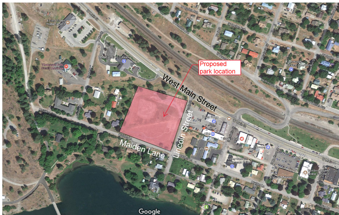
FIGURE 2. PROJECT AREA VICINITY MAP

This project entails creating a public park on an underutilized City-owned parcel in downtown Thompson Falls (see Figure 2), located within the downtown Thompson Falls Main Street corridor, just a block away from the Clark Fork River. The property was historically used for athletics and then as a baseball field, but those features were removed in 2012.