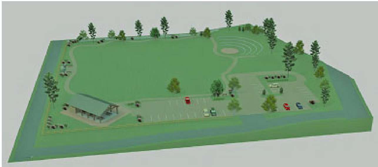
FIGURE 3. Conceptual 3D Rendering of Proposed Ainsworth Community Park

The purpose of this letter is to inform you of the project and provide you with an opportunity to comment. All comment letters received will be incorporated into the Environmental Review Record (ERR) on file for public review with the local government. A full copy of the ERR will be sent to the Montana Department of Commerce (MDOC) upon project completion. If you have any questions as you are going through your review, please feel free to email me at sreynolds@wgmgroup.com or give me a call at (406) 756-4848.