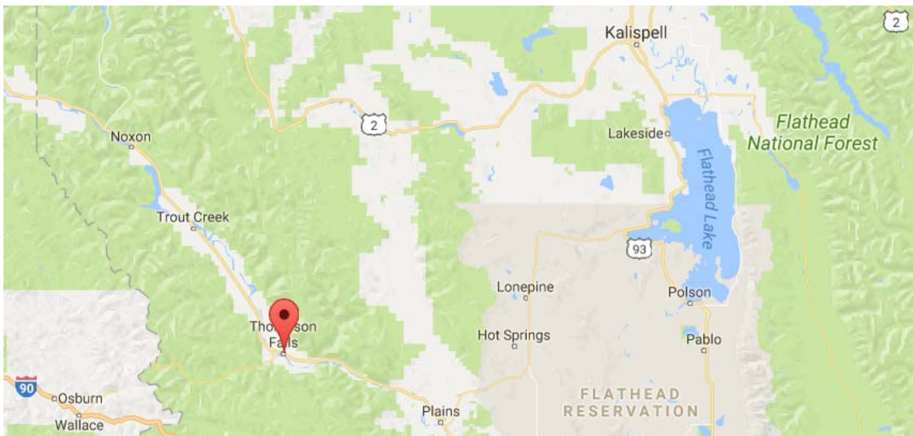
FIGURE 1. GENERAL VICINITY MAP

The City of Thompson Falls is proposing to build a park at the northwest intersection of Maiden Lane and Lincoln Street, just south of W. Main Street (Hwy 200). The project is located in Government Lot 6 of Section 7 and Government Lot 4 of Section 8, T21N, R29W, P.M., M, City of Thompson Falls, Sanders County, Montana (see vicinity map below). The proposed Ainsworth Community Park will serve as the keystone park in the City's urban system and will include a pavilion with restrooms along with an amphitheater. This park will be capable of holding events, concerts, and family gatherings. Its presence is expected to increase the number of events downtown, stimulate economic activity and contribute to the community's sense of place.