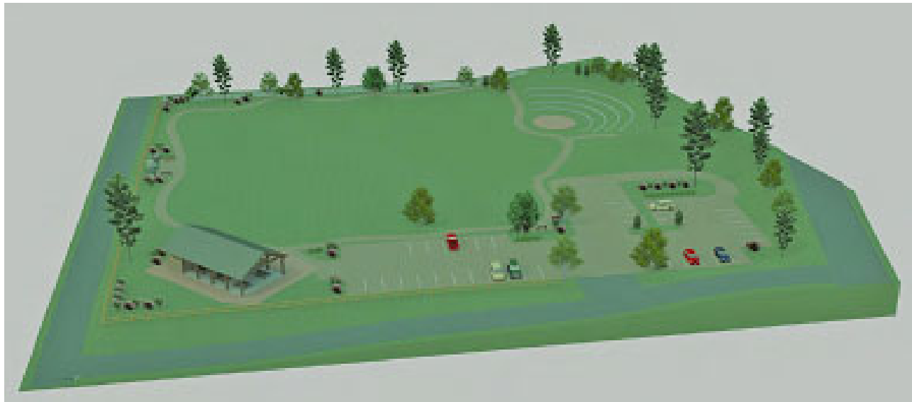
FIGURE 3. Conceptual 3D Rendering of Proposed Ainsworth Field Park

It is anticipated that the City of Thompson Falls will soon begin applying for grant funding, with the goals of completing final design in 2018 and construction in 2018/2019. Please provide comments on this project from your agency's perspective. All comment letters received will be incorporated into an appendix of the PER. If you have any questions as you are going through your review, please feel free to email me at mbrodie@wgmgroupp.com or give me a call at (406) 756-4848.