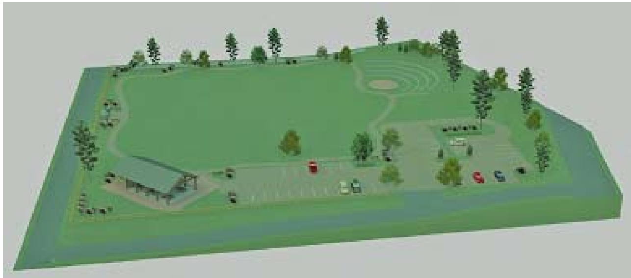
FIGURE 3. Conceptual 3D Rendering of Proposed Ainsworth Community Park

Please provide comments on this project from your agency's perspective. All comment letters received will be incorporated into the Environmental Review Record (ERR) on file for public review with the local government. A full copy of the ERR will be sent to the Montana Department of Commerce (MDOC) upon project completion. If you have any questions as you are going through your review, please feel free to email me at sreynolds@wgmggroup.com or give me a call at (406) 756-4848.