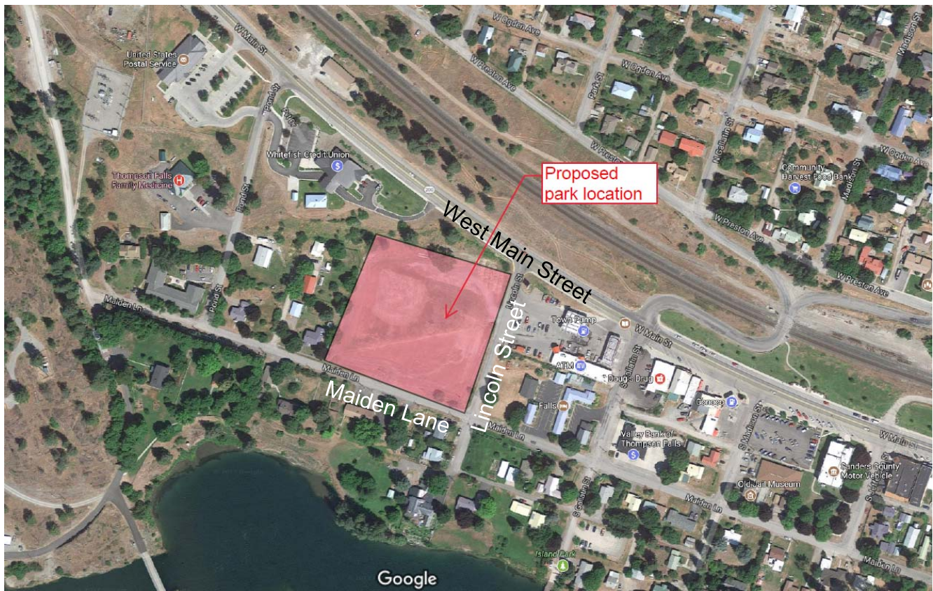
FIGURE 2. PROJECT AREA VICINITY MAP

This project entails creating a public park on an underutilized City-owned parcel in downtown Thompson Falls (see Figure 2), located within the downtown Thompson Falls Main Street corridor, just a block away from the Clark Fork River. The property was historically used for athletics and then as a baseball field, but those features were removed in 2012.