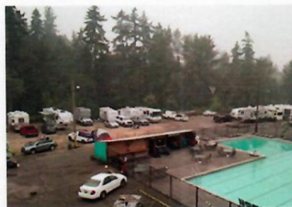
The parking lot at Milwaukie-Portland, Ore., Lodge No. 142 offers respite for evacuees.

action and applied to use its Beacon Grant to donate to the Plumas Crisis Intervention and Resource Center instead of hosting its annual Christmas party.