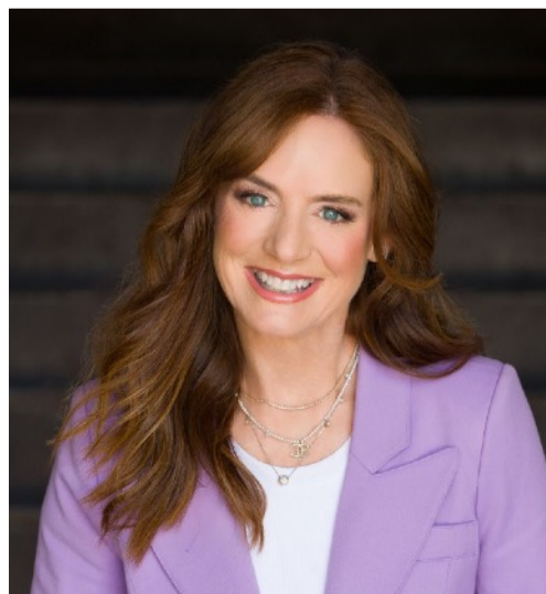
Sheri Jacobs Speaker & author of The Unexpected Power of Boundaries & others