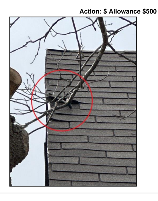
2. Roofing • Sloped roofing

Condition: Asphalt shingles • Tree branches touching roof