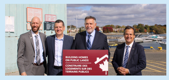
Pleased to be part of the announcement for more housing in Mississauga at 1 Port Street East in Mississauga