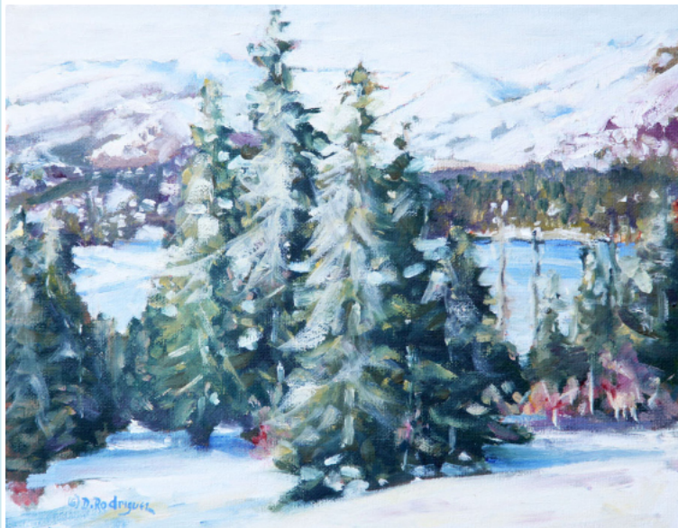
Diane Rodriguez, Oil, View From the Train, Donner Lake