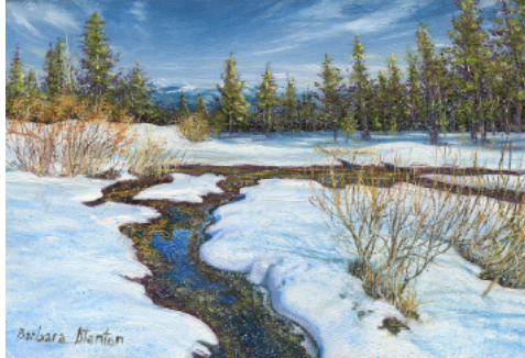
Barbara Stanton, miniature oil paintings, included "Snow Melt" Oil, 3 1/2"x2 3/8" and Desserts Denied, also Oil, 2 7/8"x3 1/4."