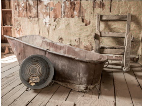
Ron Rigge: I found this wonderfully remodeled bathroom at a remote ghost town in Idaho. Great for those cold winter nights too!