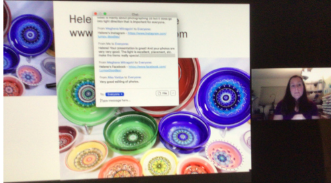
Helene Roylance's Zoom Presentation

https://localnewsmatters.org/2020/12/14/artists-unite-in-the-tri-valley-arts-groups-join-forces-to-support-creators-in-the-pandemic/