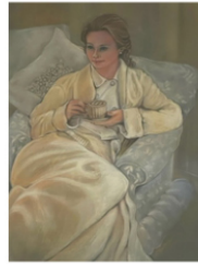
Morning Latte

Opening Saturday, November 6, 2021 and showing through Saturday, December 18, 2021. Harrington Gallery Hours: Thursdays, 10AM-12PM, Fridays, 3-5PM, Saturdays, 11AM-3PM and Special Hours on Sunday, November 14, 2021 from 11AM-3PM