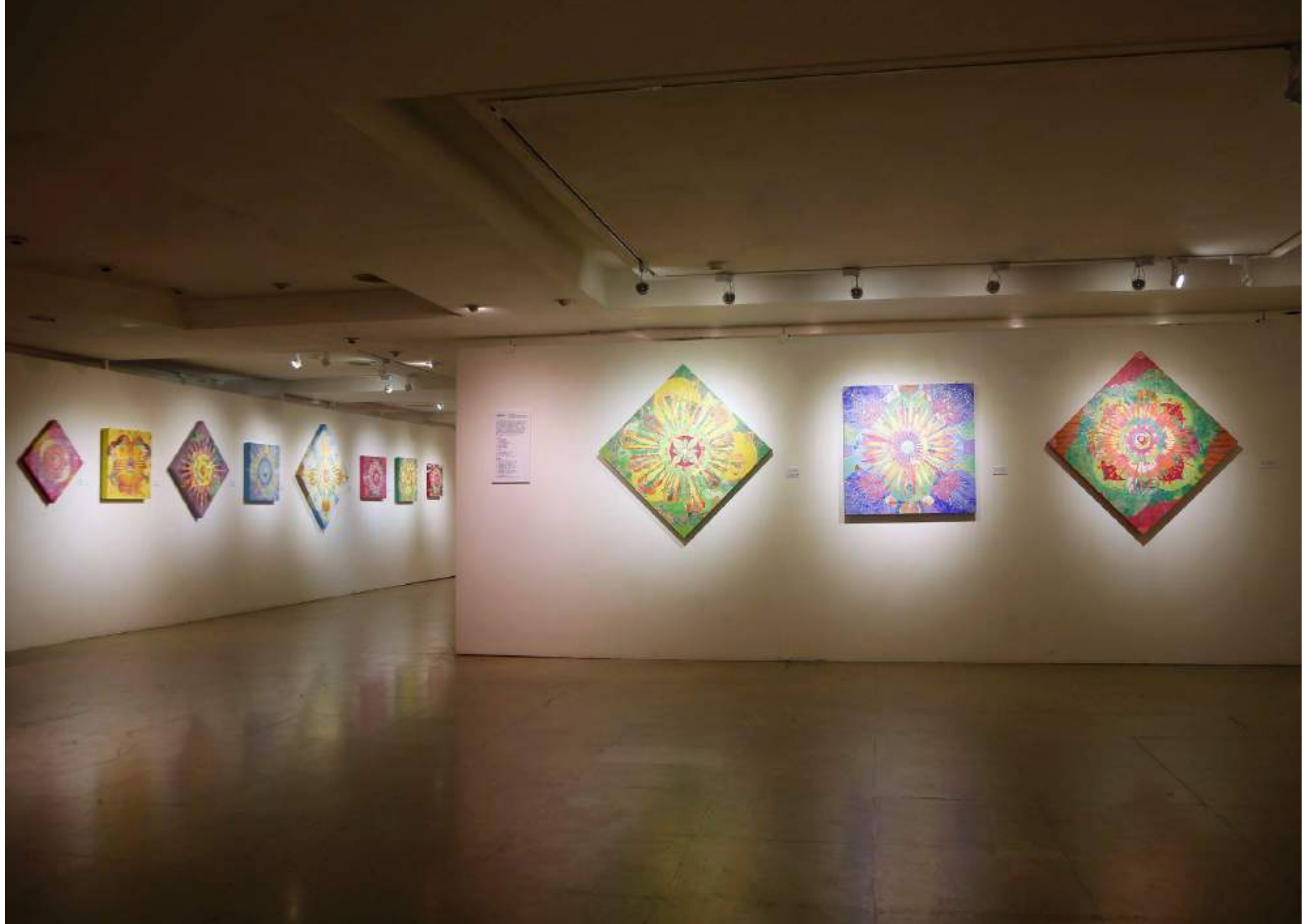
2017 Modern Art Gallery