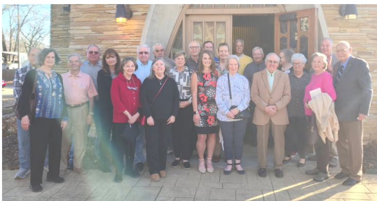
Some of the 8:45 a.m. Worship participants. See you in 2026 Praising the Lord together!