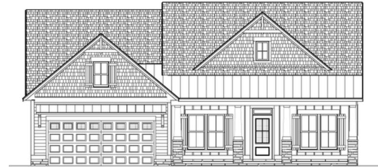
Elevation B - Includes Exterior Upgrades

Contact: Todd Garrett PO Box 2200 Leland, NC 28451 (910)443-0243