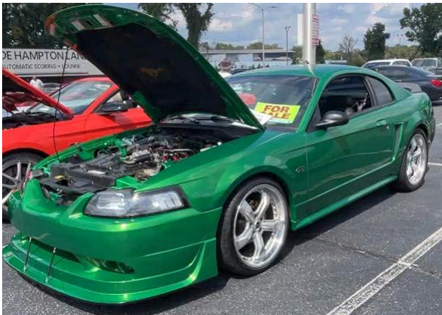
Tom Wells - '00 Green Mustang