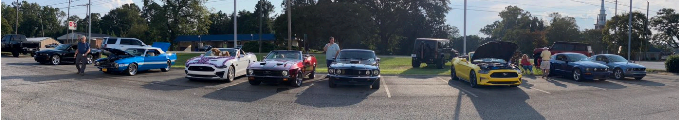
Just a handful.