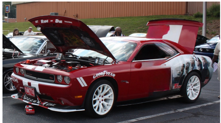
'13 Dodge Challenger