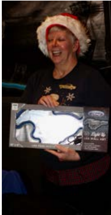
Gabi likes this, but wait, it's been taken, so she took the wine