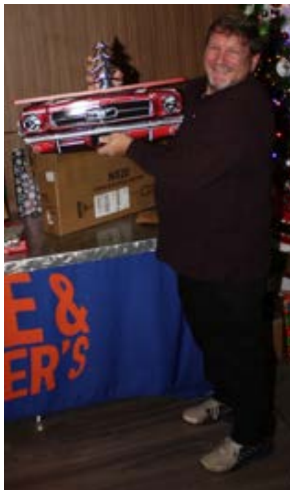
As is Clayton