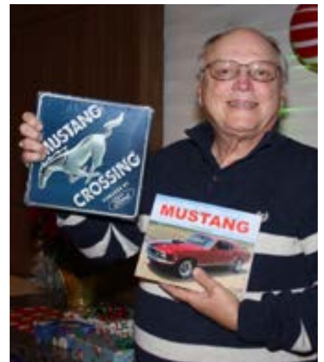
Scott has more coffee table books