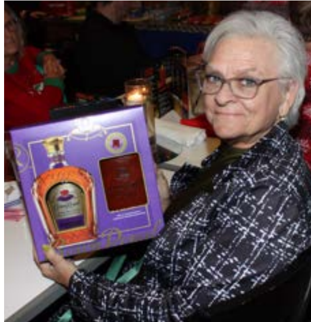
Celeste didn't think so, so she took it!