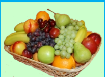
Fruits / Veg Shops