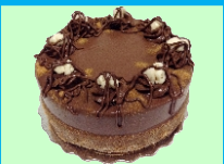
Snacks / Bakeries Sweet Stalls