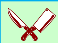
Fish / Chicken / Meat Stalls