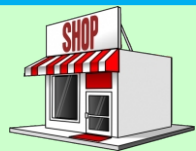
Whole Sale / Retail Shops