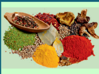
Pulses / Spices shops