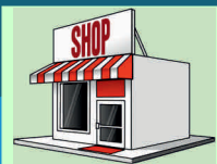
Whole Sale / Retail Shops