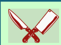
Fish / Chicken / Meat Stalls