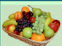
Fruits / Veg Shops