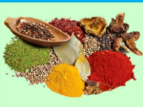
Pulses / Spices shops