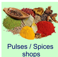
Pulses / Spices shops