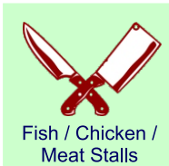
Fish / Chicken / Meat Stalls