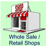
Whole Sale / Retail Shops