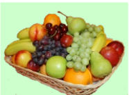
Fruits / Veg Shops