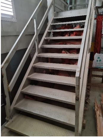
Staircase before installation.