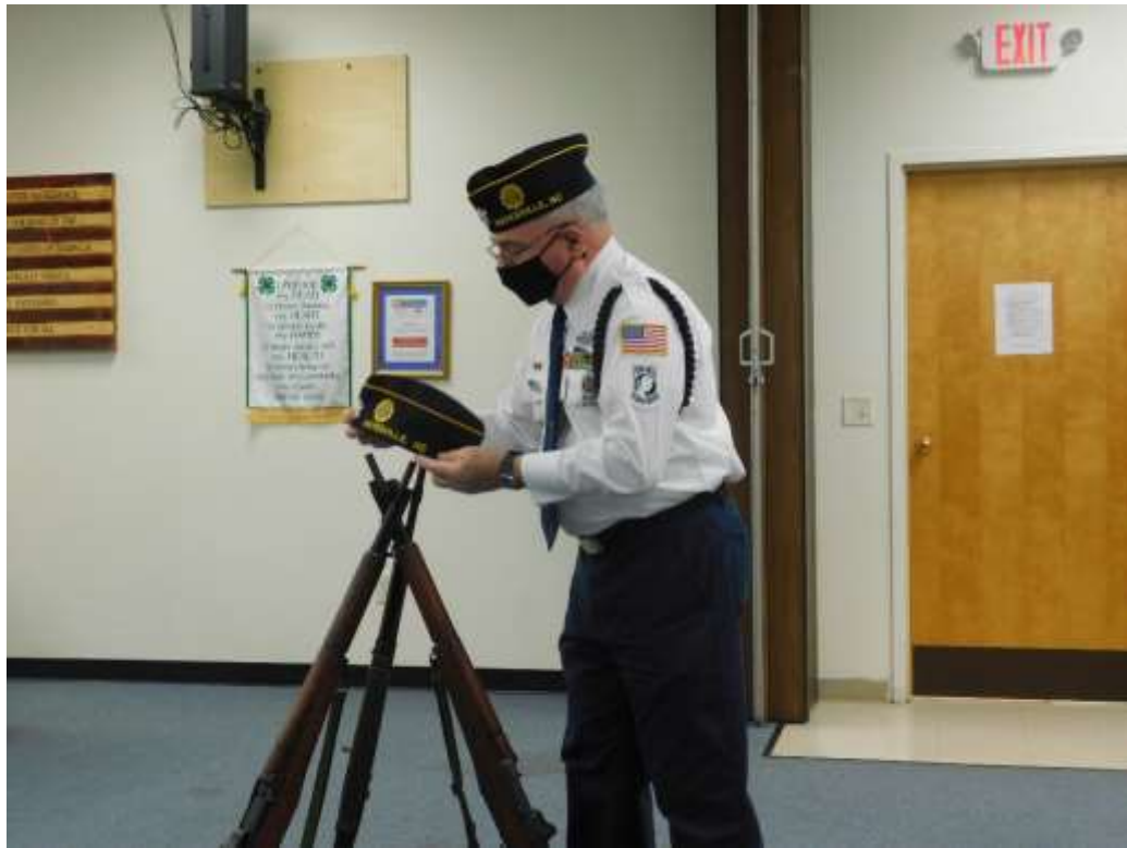
Comrade Adjutant, remove the COVER.