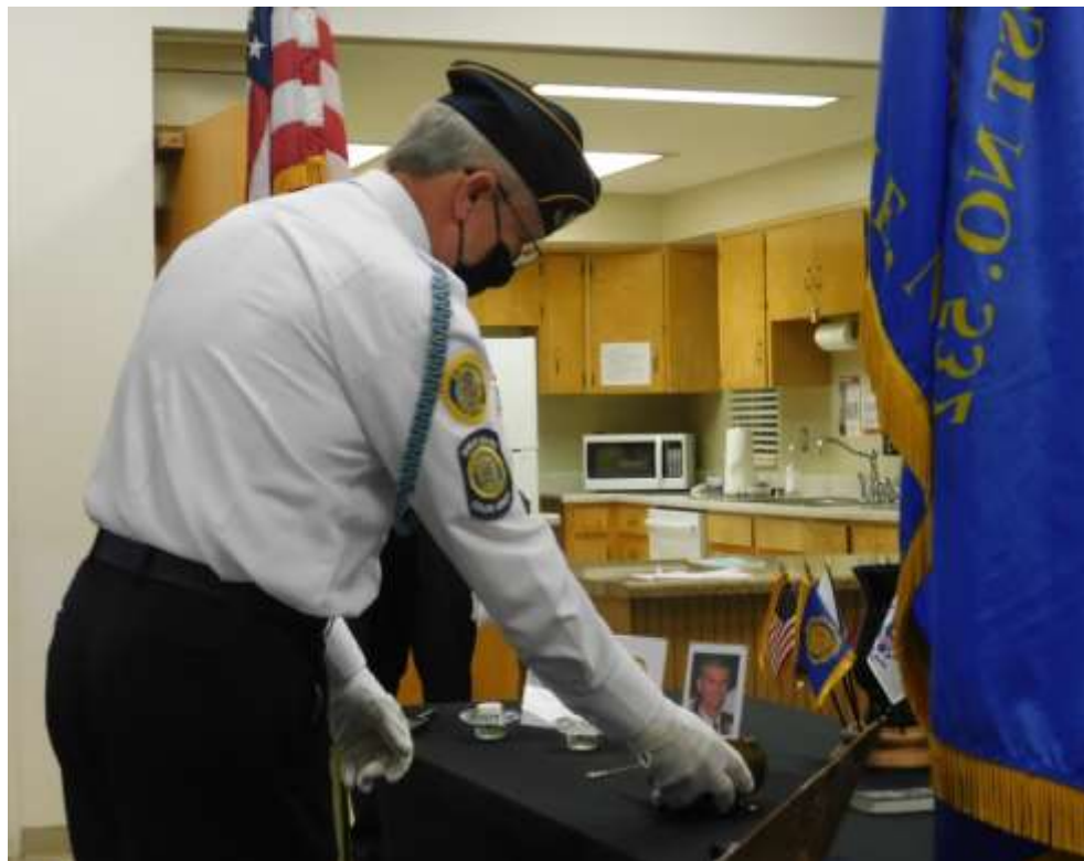
Sergeant-at-Arms remove the brazier.