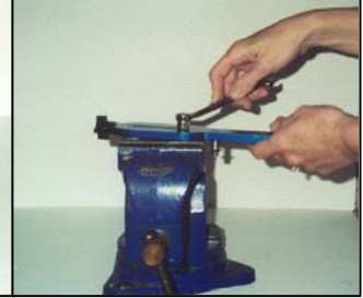
9. Cutting filter by hand.