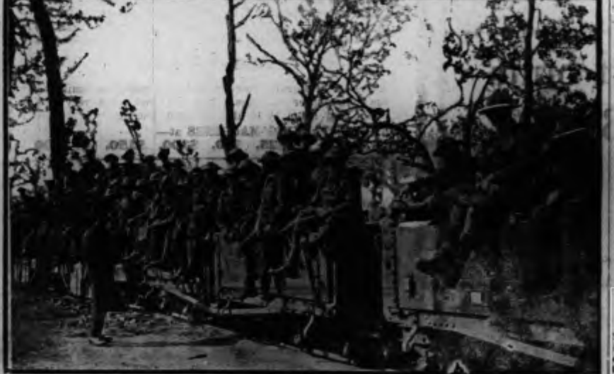
Welsh battalions being conveyed to the front.—They fought magnificently in the storming of Zonnebeke—gaining a line of their objectives.