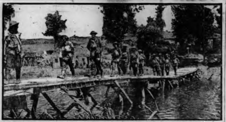
Battle of Menin Road—Infantry crossing the stream after having driven the Hun back.