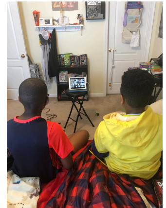
(Right) Two students sitting 3 feet apart viewing virtual class.