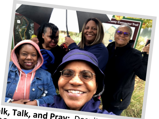
Walk, Talk, and Pray: Despite the rain, the ABC Singles Ministry Walk, Talk and Pray was a success. Enthusiastic walkers came together to fellowship and exercise.