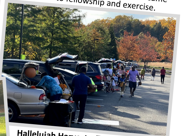
Hallelujah Harvest—Trunk or Treat: ABC provided a safe environment for children and youth to collect candy treats, play games, participate in cake walks, and much more.