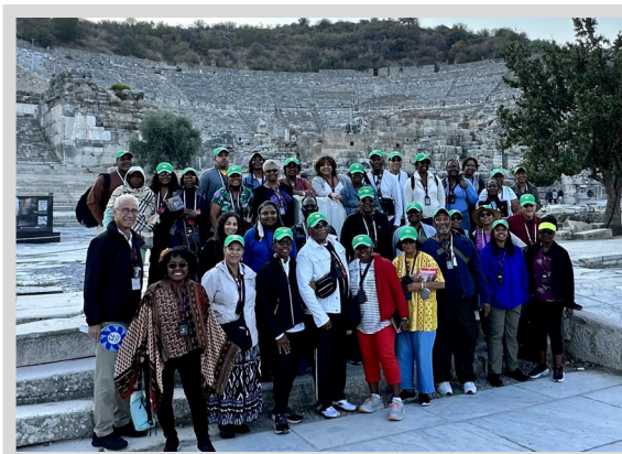
Ephesus: Paul received encouragement from the church