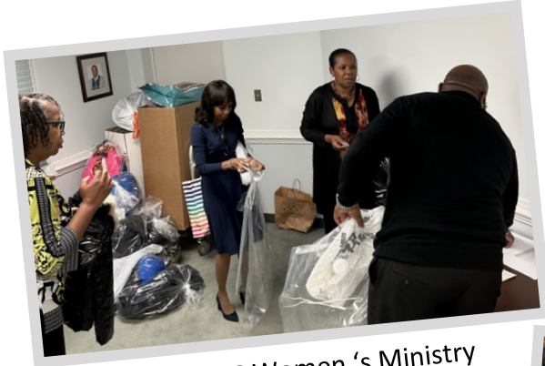
Coat Drive: ABC Women 's Ministry collected winter coats to support Woodley Hills Elementary School children.