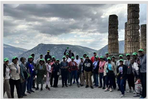
Delphi: Archaeological site

The group toured the city of Corinth where Paul received a vision from the Lord. (Acts 18:10). As Paul spoke, Crispus and many others believed and were baptized (Acts 18:8) and established the church at Corinth to whom he later wrote his two epistles. Discovering the Archaeological Museum, marketplace, and temples along the way, they walked among the ruins, stood on the Bema, where Paul stood before Gallio to face charges before departing to Syria (Acts 18:12-18). The rich architectural splendor of the ancient city of Athens introduced them to the world renowned Acropolis, the Propylaea, the Parthenon, and the Erectheum. Standing on Mars Hill as Paul did (Acts 17:23), the group gained an intimate knowledge of Paul's journey. The Antioch Missions Ministry is committed to training, encouraging, and exhorting the church concerning its participation in the Lord's Great Commission.