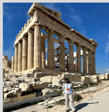
Acropolis: Paul spoke to Athenians