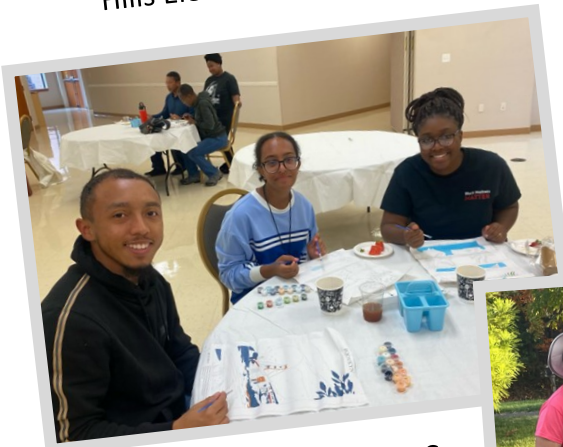
GenC Cider Sip and Paint: ABC members gathered to sample ciders, fellowship, and paint. Everyone had a wonderful time.