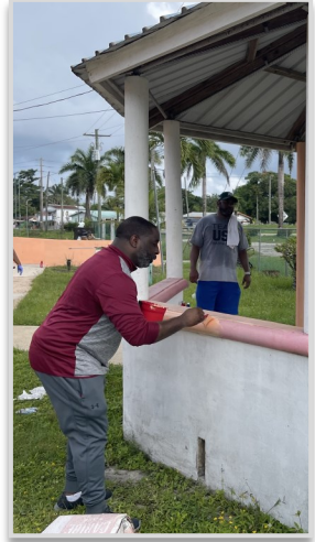
A brush in His hand, is different than a brush in ours! —Pastor Taylor