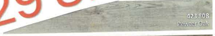
423 808 Rawner Oak