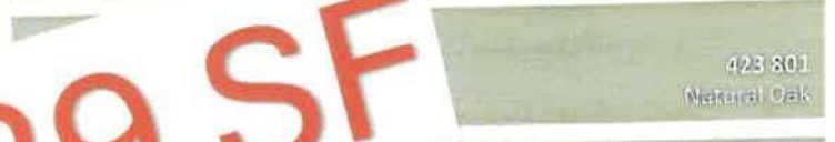
423 801 Natural Oak