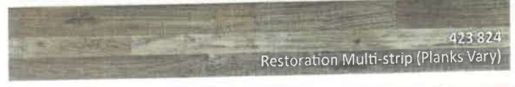
423 824 Restoration Multi-strip (Planks Vary)