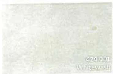
424 001 Whitewash