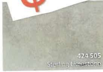
424 505 Sterling Limestone