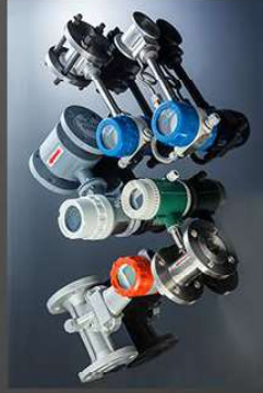
Flow Measurement Sensor