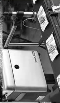
Smart gas station