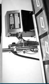
Printing / coding equipment