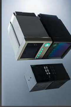
Display & Control