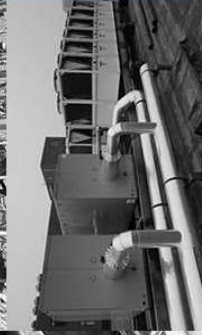
Smart environment monitoring