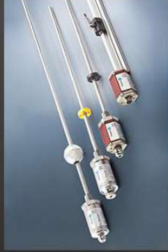
Magnetostrictive Displacement Sensor