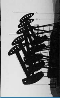
Energy Sector oil Industry