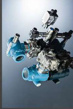
Differential Pressure Sensor