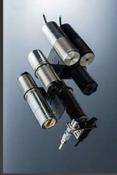
Infrared temperature measurement