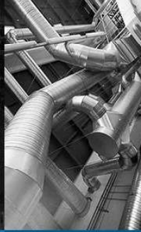
HVAC Chemical Industry