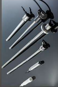
Liquid Level Sensor