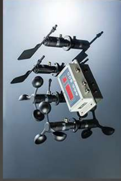
Wind Speed & Direction Sensor