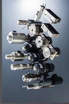
Load Cell & Weight Sensors