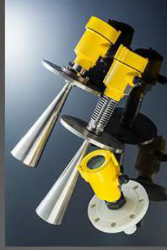
Radar level gauge