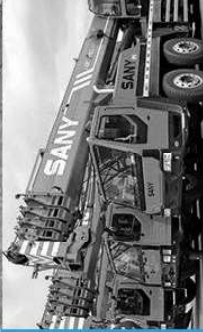
Engineering Textile Machinery