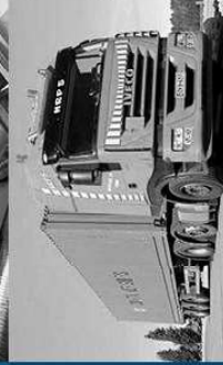
Auto motive / steel industry