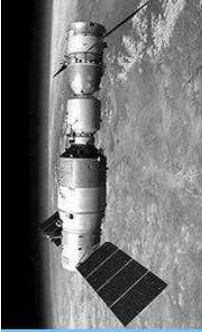
Space/ Navigation/ Military project