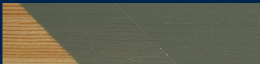
C 506 SMOKE 3