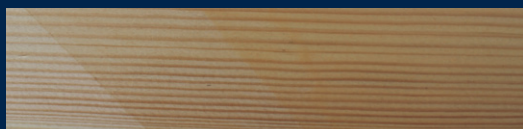
TR 4131 BRIDGEWATER