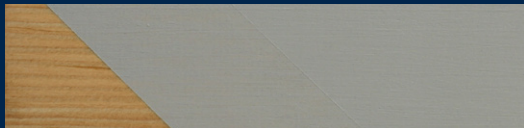
C 505 LIGHT GREY 1