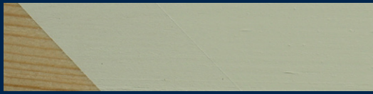
C 501 IVORY 1