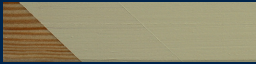
C 502 VANILLA 1