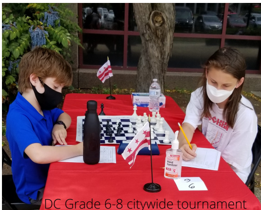
DC Grade 6-8 citywide tournament