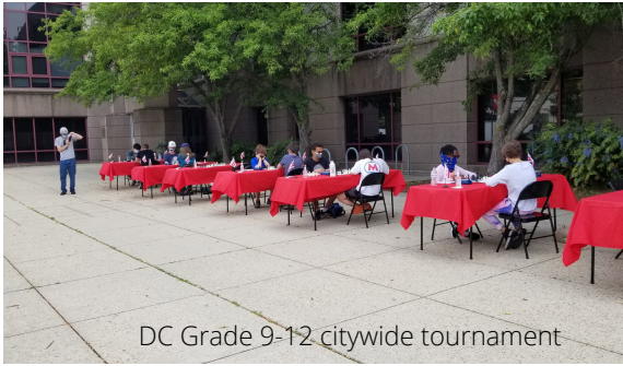
DC Grade 9-12 citywide tournament