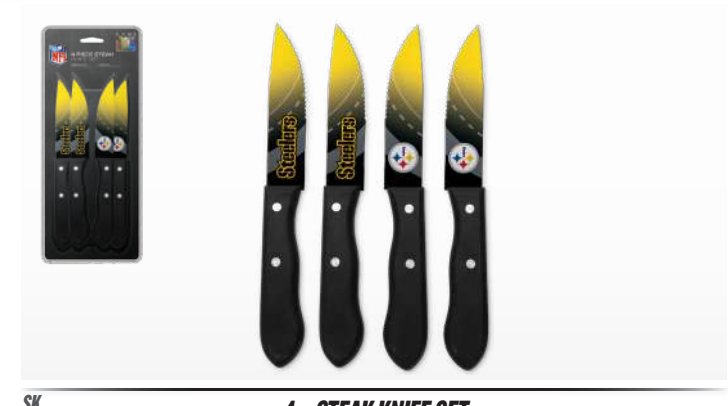
4PC STEAK KNIFE SET Set of four 430 grade stainless steel serrated knives with ergonomic polypropylene handles