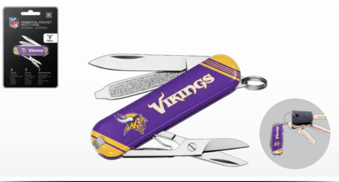
ESSENTIAL POCKET MULTI-TOOL