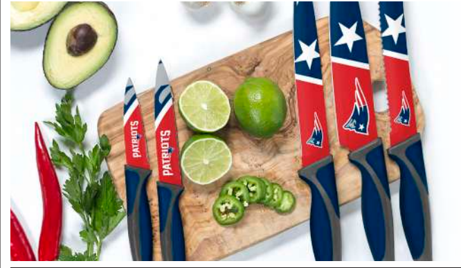
KITCHENWARE / BBQ COLLECTION