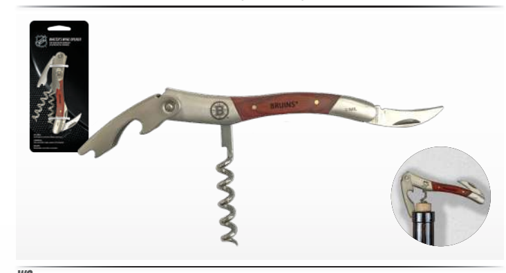
WAITER'S WINE OPENER