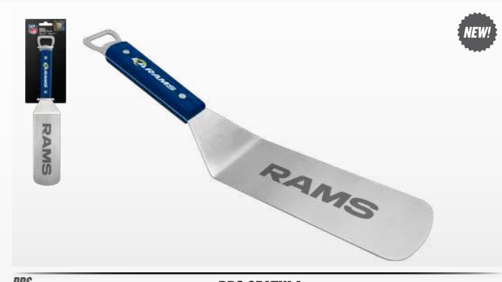
BBQ SPATULA Stainless steel spatula with laser engraved wordmark, custom artwork on wood handle , and bottle opener