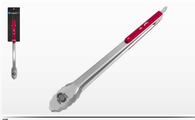
16" KITCHEN TONGS