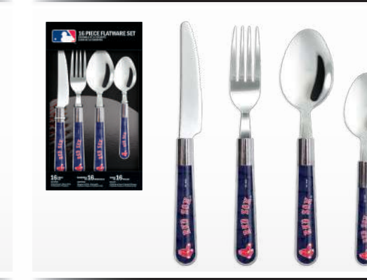
16pc FLATWARE SET Set includes four dinner knives, four dinner forks, four tablespoons, and four teaspoon