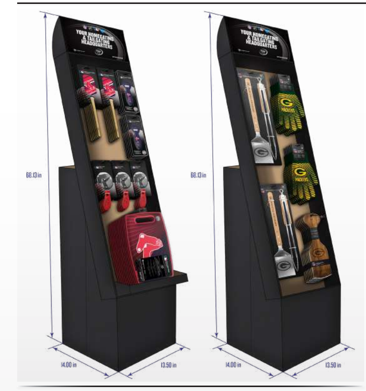
TILT DISPLAY PROGRAM

The Sports Vault Corp. is proud to offer high quality, customizable, free standing display options in an array of TSV Home items and configurations, to match any of your specific retailing needs.