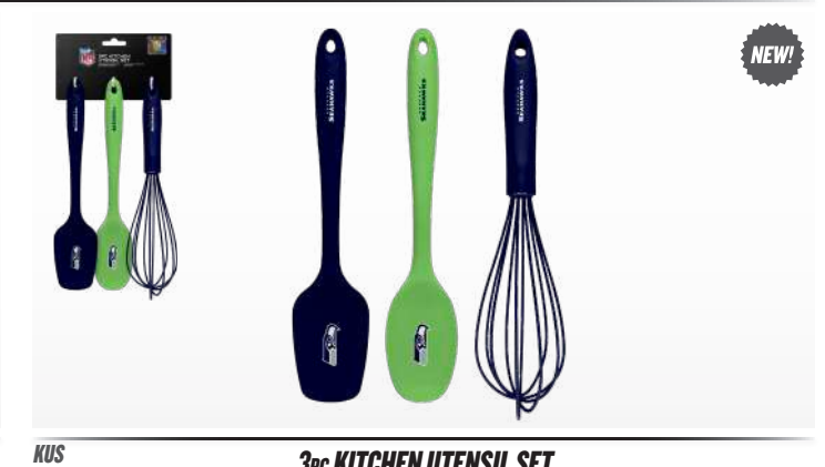
3PC KITCHEN UTENSIL SET