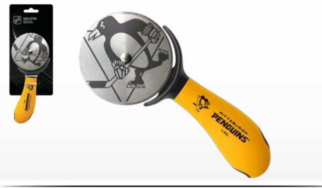
PIZZA CUTTER Ergonomic pizza wheel with non-slip grip