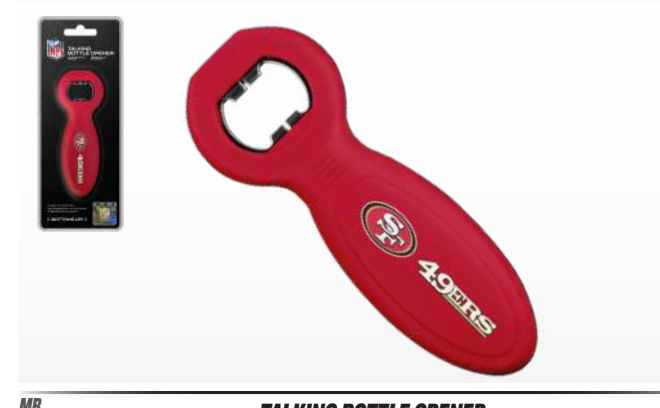
TALKING BOTTLE OPENER Includes a toast to your team