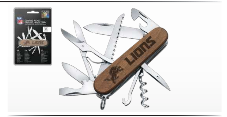
CLASSIC WOOD POCKET MULTI-TOOL