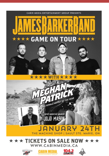
January 24<sup>th</sup> | Tickets $35 | All Ages