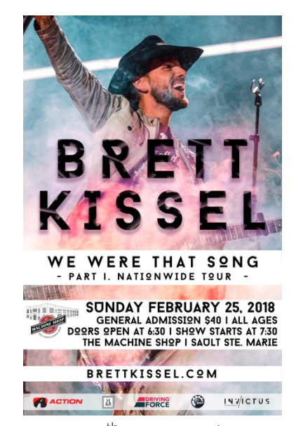
February 25<sup>th</sup> | Tickets $40 | All Ages