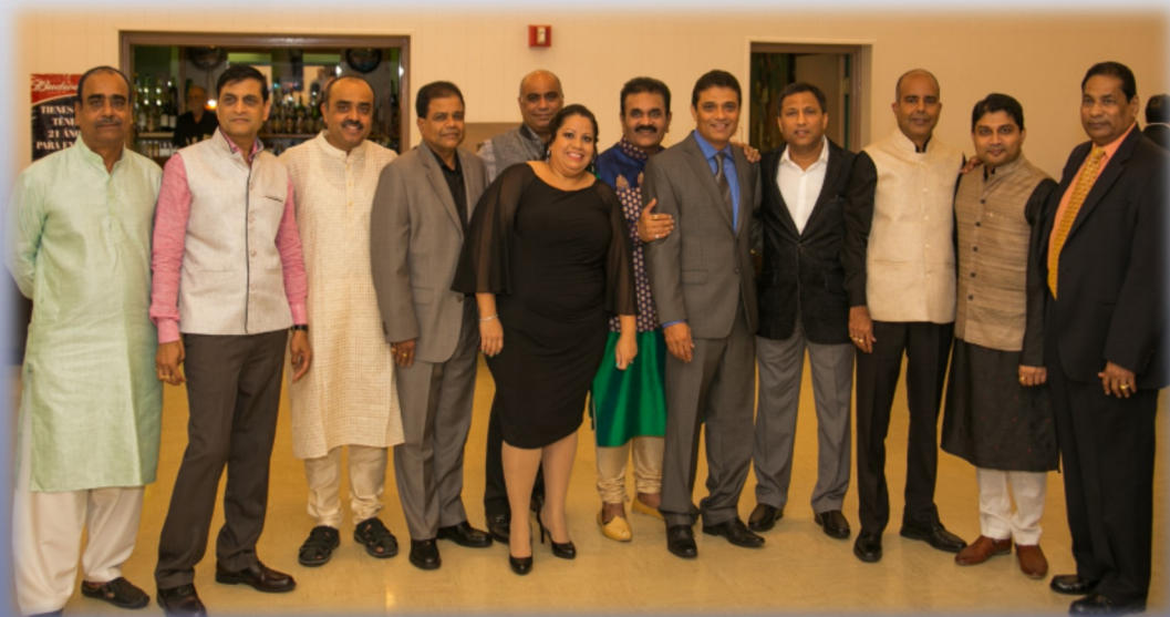
Successful event by Enforcement Office