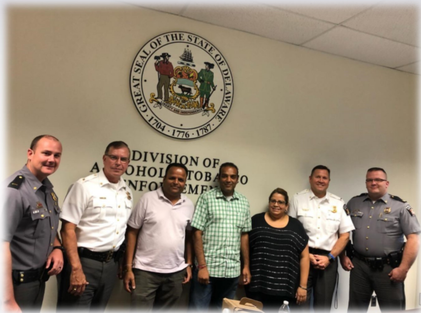
Coffee With a Cop